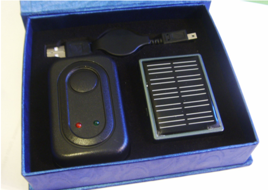
Figure 2 the GSM bug microphone kit and contents