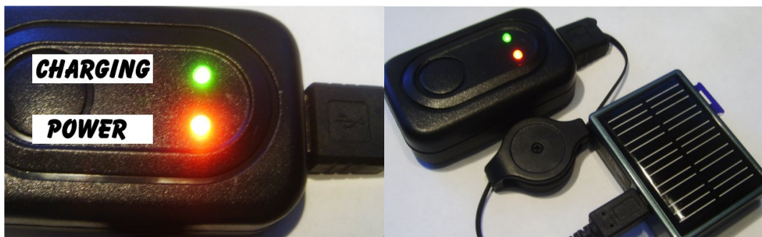
Figure 3 charger connected and charging the bug microphone