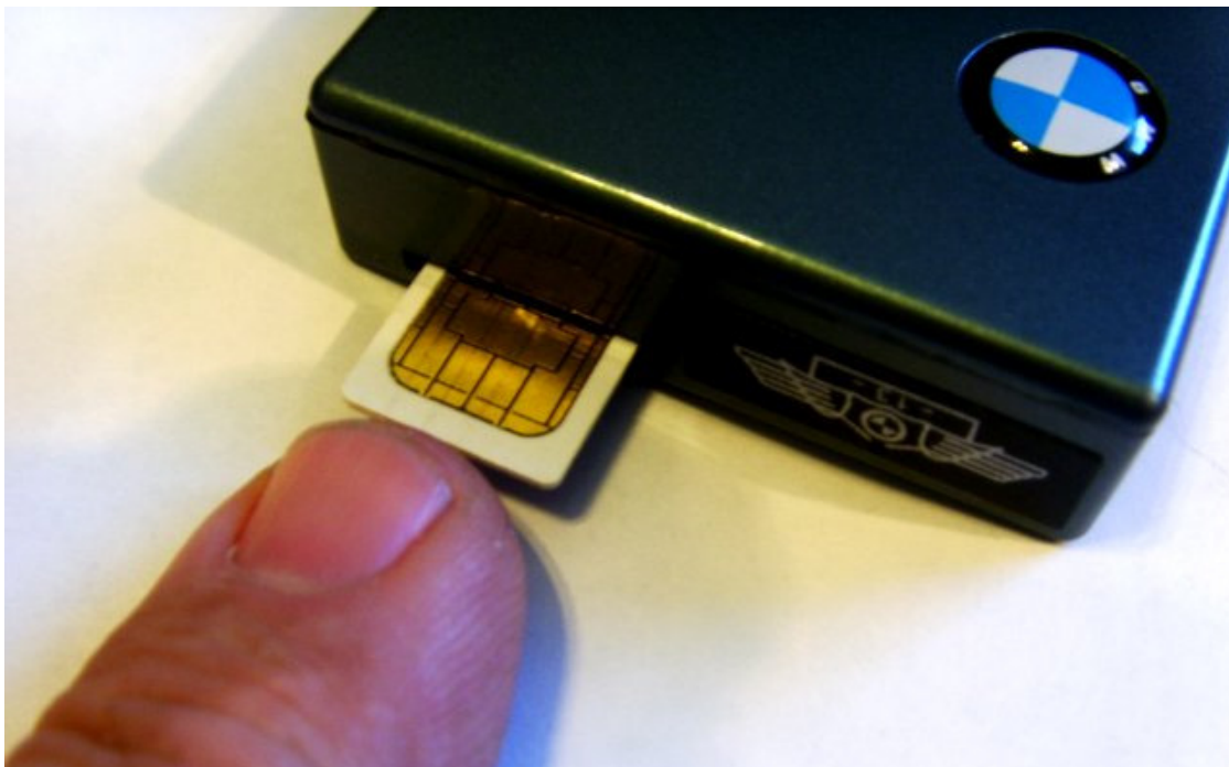
Figure 4 inserting the SIM card (observe the SIM card orientation).